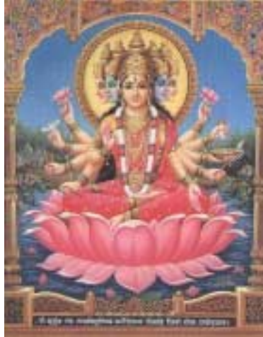
Gayatri, the Mother of Holy Vedas

While it is true that the word ‘man’ is used in a generic manner to denote ‘human beings’ in the Vedas, authoritative grammar and ritual texts 13 emphasize that this is merely a figure of speech, and that man and woman together constitute two halves of the same Persona while performing Vedic sacerdotal ceremonies. The language in which the revealed Hindu texts are composed, namely Sanskrit, has a neuter gender in addition to the masculine and feminine. In fact, the Ultimate Reality, the Supreme God 14 of Hindus, is often described as gender neutral. Interestingly, in a famous verse of Rigveda that says that all the various deities are but descriptions of One Truth, the names of deities are all masculine but the phrase ‘One Truth’ (‘ Ekam Sat ’) is in neuter gender as if to emphasize that God is not male. The Gayatri Mantra, the holiest prayer of Hindus in the Vedas, is often represented symbolically as a Devi in classical Hinduism. She is thus a female deity, who is also often termed as the ‘Mother of all Vedas’, and giver of boons 15 .