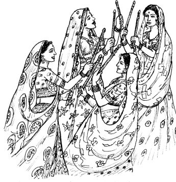
Dandiya – a dance performed during Navaratri in Gujarat

Popular Hinduism also exhibits the concept of ‘ grama-devata ’ in which a local manifestation of the Divine is worshipped as the presiding deity of that place. Many Indian cities and towns, including several important pilgrim centers, have various forms of the Divine Mother as their ‘ grama-devi ’. As examples, we may cite Amba who is worshipped in Kolhapur and Ahmadabad (formerly called Ambavad); Meenakshi who is worshipped in the pilgrim town of Madurai; a form of Sati, the wife of Shiva, worshipped in Jalandhar; and Dhakeshvari Devi of Dhaka (capital of Bangladesh).