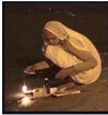
A widow performing worship

Woman as Widow: The Vedic texts 143 indicate that widow remarriage was allowed. The Dharmasutras appended to various Vedic schools also permit widow remarriage. 144 This general permission for remarriage of widows was maintained in some texts of classical Hinduism 145 . In certain cases, if the husband went abroad for longer than a particular period of time, the woman was permitted to remarry as well. 146 In general however, the status of widows declined steeply when the texts of classical Hinduism were formulated. As a result, remarriage of widows was highly frowned upon 147 and the ideal widow was expected to live a life of piety, austerity and self-abnegation. 148 Likewise, a widower was excluded from the sacred ritual but could remarry in order to enter normal life, or he could chose to live celibate. No stigma was attached to the remarriage of a widower.