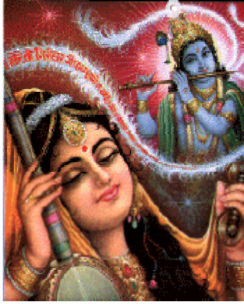
Saint Meerabai (1498-1546 CE)

roamed the Kashmir valley singing her mystical songs, demonstrating Yogic feats while lost in the bliss of Bhagavan Shiva. Her spellbinding songs are recited even today.