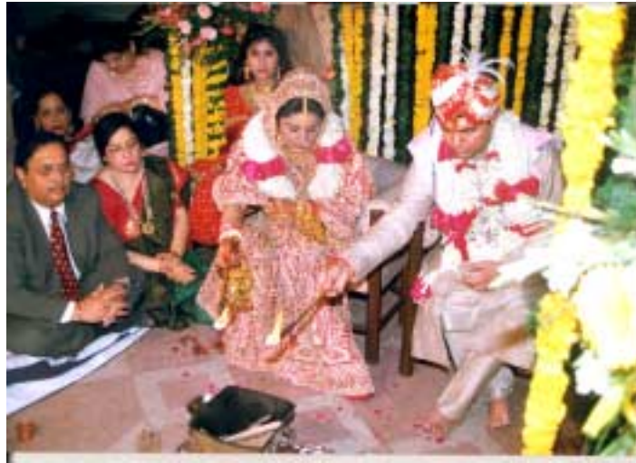
Bride and Groom light the sacred altar together

A man becomes eligible to perform Vedic rituals only after he marries 133 . The husband and wife are exhorted to perform their religious ceremonies as a pair. 134 If the husband is married, he cannot perform Vedic ceremonies without his wife. 135 During religious ceremonies, the wife holds the hand of her husband whenever he pours the oblation into the sacred altar, signifying that the ritual is performed jointly by them.