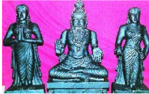
Sage Yajnavalkya with Sage Gargi and Sage Maitreyi

The Brihadaranyaka Upanishad, the longest text of Hindu spirituality, describes the proceedings of a marvelous spiritual conference in which the great Sage Yajnavalkya was locked in a debate with several Sages on the other side. Suddenly, a woman sage named Gargi Vachnavi rises and says that if Sage Yajnavalkya can answer her questions, all the other Sages will accept his doctrines 33 . It is noteworthy that all the Sages present there accept her as their spiritual leader and allow her to represent them on their behalf. In the same text, Maitreyi, the wife of Yajnavalkya, motivates him to deliver a memorable sermon on the nature of God and soul. Modern India has honored these illustrious women by founding colleges bearing their names 34 . In a long spiritual lineage given in this text, all the teachers and students are listed as sons of their mothers.