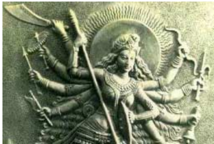
Shakti, the Almighty Divine Power

In this tradition, the Divine Mother is termed as ' Shakti ' or 'The (Supreme) Power', as 'Uma' or the Sacred Wisdom, as 'Mahesvari' or 'The Supreme Goddess' and so on. The Shaakta tradition has hundreds of texts (often termed generically as 'Tantras') and traditions considered authoritative by Hindus even outside that specific tradition.