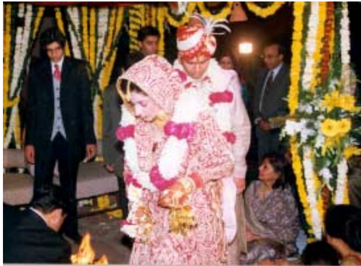
Bride leads the final circumambulation of the sacred altar to conclude the ritual

The wedding ceremony involves the bride and the groom walking seven steps together. At the seventh step, the groom is made to declare that he chooses his wife as his lifelong friend. Another custom is to tie the hems of their garments together in a knot, and going around the sacred fire altar four times. The last of these four circumambulations, symbolizing salvation is lead by the bride. This indicates that the salvation of the husband (and the wife) is not possible without her involvement in procreation of children and in religious observances.