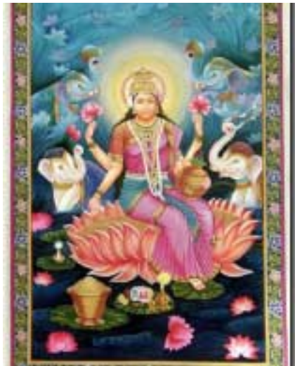
Devi Lakshmi, deity of Wealth and Prosperity

In numerous Hindu communities of Bangladesh, Nepal and India, the most prominent festival in the year is dedicated to the Divine Mother. During Diwali, the most important festival in northern India and amongst Hindu communities in the Caribbean, the main worship is offered to Devi Lakshmi. Diwali itself is often called 'Lakshmi Pujan'.