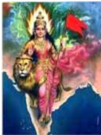
Iconic representation of Mother India (Bharatmata)

One's country is always termed as 'Motherland', never as Fatherland in recognition of the fact that the land we live in nurtures us lovingly as our own mother. Indians often worship India as 'Bharatmata'.