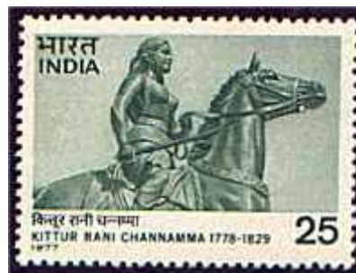
Kittur Rani Chennamma

Rani Chennamma of Kittur 74 (1778-1829) received training in horse riding, sword fighting and archery in her young age. She was married to Raja Mallasarja of Kittur, a princely state of Belgaum in Karnataka. Her husband died in 1816. Her only son died in 1824. Chennamma adopted Shivalingappa as her son and made him heir to the throne. The British did not accept this and ordered the expulsion of Shivalingappa. The Rani defied the order. A great battle ensued. The Rani fought the British with great courage and skill. She could not, however, hold out for long. She was taken captive and lodged in Bailhongal Fort where she died on 21-02-1829.