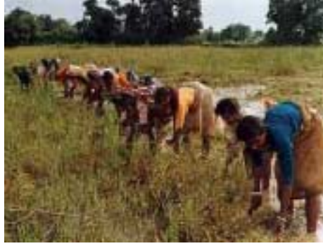
Women planting paddy

produce wealth. Since times immemorial, Hindu women have worked in the fields, as artisans and so on.