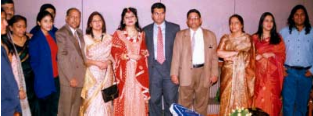
Groom's family welcomes the bride

The bride is considered an embodiment of good-luck and auspiciousness and is welcomed by the groom's family. The Vedic verses express the hope that the bride will be regarded like an Empress by her in-laws. 115