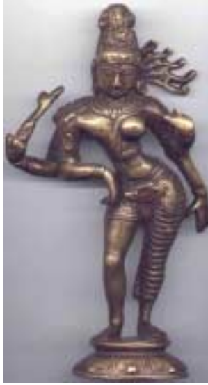
Ardhanariishvara – God who is half woman

Even male deities such as Lord Vishnu sometimes incarnate as women to serve the cause of Dharma.