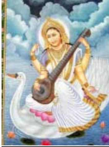
Devi Sarasvati, embodiment of the Divine Word, Deity of Wisdom, Patron of Art and Literature

It is common to read in scriptures of mankind God is like the husband of all human beings and of all churches. In the Vedas however, we even read that God is like a dear wife whom ‘His’ worshipper loves like a doting husband 16 . The ‘Divine Word’ 17 , itself is likened to a beautiful maiden who manifests her beauty to the husband 18 .