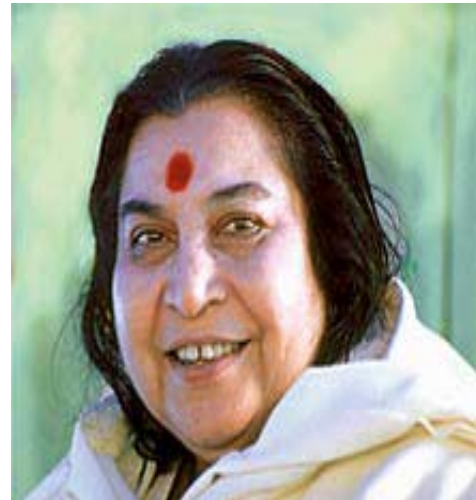
Mata Nirmala Devi, Sahaja Yoga Guru

Ammachi, as Mata Amritandamayi is lovingly called by followers, was born in a humble Hindu harijan family of Kerala. From her childhood she was lost in Divine Love for God. Today, she travels all over the world preaching love for God and compassion for human beings. She is well known for embracing all the visitors who come to see her with patience and compassion, and with an eternal beatific smile that leaves a profound spiritual effect on them.