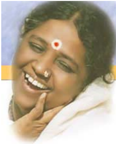
Mata Amritanandamayi 'Ammachi'

In our times, Mata Amritanandamayi and Mata Nirmala Devi as Hindu women Gurus are well known today in the international spiritual circuit as teachers of Divine Love and of Yoga.