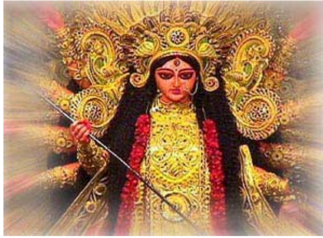
Durga, the Divine Mother

tradition 22 have perhaps a greater geographical spread than those of other traditions in the Indian subcontinent.