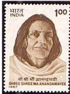
Shree Shree Ma Anandamoyi

and spirituality, and was instrumental in the setting up of many hospitals and other charitable institutions.