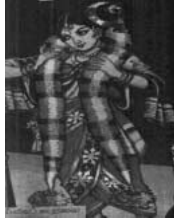
Saint Andal (8 th century CE)