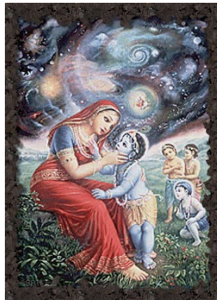
Mother Yashoda with Lord Krishna

In a hymn, Shri Shankaracharya (8 th century CE) declares that while a son can be a bad son, a mother can never be a bad mother. The mother is considered a thousand times more venerable than the father 80 . When students graduate from their school, their teachers exhort them to consider first their mothers 81 , followed by others, as embodiments of God. If a Hindu man becomes a monk, he is required to sever all his biological relationships so that even his own father is required to salute to him. The sole exception is made for his mother – a monk must salute his own mother if he encounters her in the course of his itinerant lifestyle. Motherly love and affection are considered so exalted and pure that the Hindu doctrine of vaatsalya-bhakti advocates loving God just as a mother loves her child. A recurring theme in Hindu devotional literature is the childhood of Divine Incarnations in the loving care of their mothers. For instance, Mother Yashoda (adoptive mother) and Devaki (biological mother) are frequently remembered in hymns together with Lord Krishna.