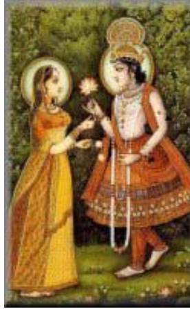
Radha and Krishna

It is important to note that when God is worshipped as ‘Divine Couple’ by Hindus, the name of the feminine typically precedes that of masculine. For instance, we say that we are worshipping ‘Sita-Ram’, ‘Radhe-Shyam’, ‘Uma-Mahesh’ or ‘Shri Vishnu’ and so on.