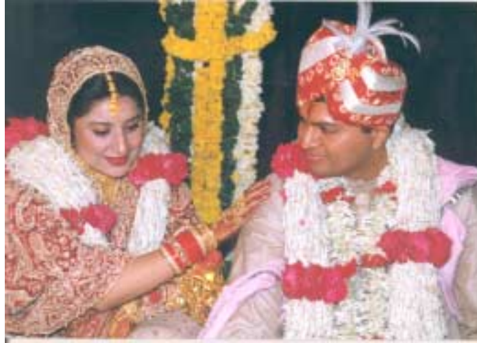
Bride says to Groom: 'I shall be your comrade all my life'

assembly. 138 For a husband, his wife is his own half 139 and is therefore called ardhaangini ('half of oneself'). She was a comrade in life ( sahachari ), an equal participant in performance of and in reaping fruits of good deeds ( sahadharmini ).