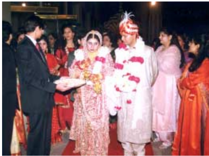
The bride's family grieves when their precious daughter leaves after her wedding

Hindu poets 93 say that the birth of a daughter made her parents weep, because as soon as they saw her face for the first time, they realized that their precious jewel would eventually leave them and live with someone else. Daughters were therefore traditionally regarded as ' paraayaa dhana ' or 'a treasure that really belongs to someone else'. At the time of her wedding therefore, her father or her brother ritually 'gifted' 94 their most precious diamond (i.e., their daughter/sister) to her husband, after extracting promises that he would always take good care of her even if he has to forsake his life, just as her father and brother had done earlier. In fact, in Hindu families that are financially comfortable, daughters are literally pampered (compared to sons) because they would have to manage a lot of household work in their future husbands' home anyway. At seeing their daughters leave their homes and proceed to their husband's abode, parents are filled with grief. 95 Things are changing rapidly in the Hindu society however and it is often seen that a married daughter takes more care of her aged parents than their son.