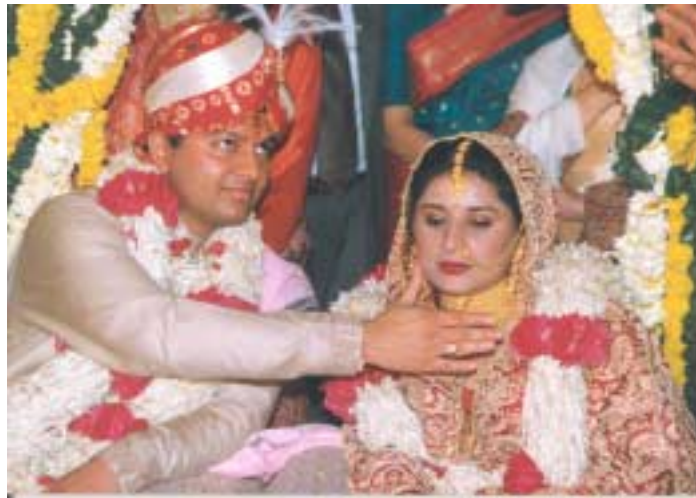
Groom says to bride: 'I unite my heart with yours'

There is no greater sorrow than to see the death of one's sons and one's wife. 140 The wife is dearer than one's own life, she is to be treasured like one's mother, and respected as an elder sister. 141