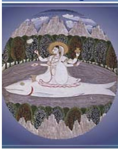
Iconic representation of Mother Ganga

It is Mother Ganga, Mother Yamuna, Mother Kaveri and so on who have manifested as rivers to feed mankind. Likewise, forests that provide us with so many resources are said to be presided over by Devis who are known as Vanadevis (vana = forest).