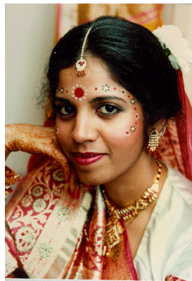
A Hindu bride (with north Indian or Nepali costume)

Woman as the Bride: It appears that women had considerable freedom in Vedic times to choose their own husband. 112 Although there is no evidence in Vedic literature for early marriage of women, classical Hinduism texts advocate marrying off one’s daughter before she reaches puberty (although the marriage cannot be consummated till she attains puberty). Premature marriages has had a disastrous effect on the health of Hindu women, and laws have been enacted in India to prevent marriage of women till they turn 18 years of age. 113