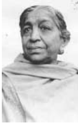
Sarojini Naidu, Indian woman freedom fighter

In the Sikh tradition too, women warriors and military generals played a crucial role in their battles against Afghan and Pathan Muslim oppressors.