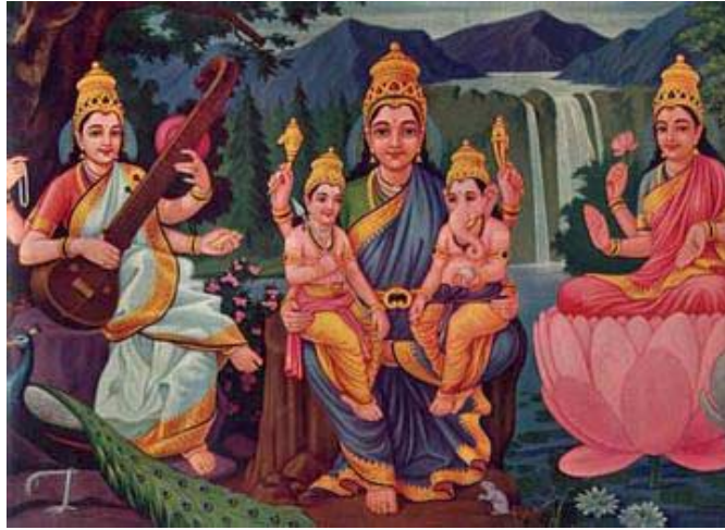
Ganesha and Skanda with mother Parvati, flanked by Devi Sarasvati and Devi Lakshmi

whom only she could call her own. Ganesh is typically worshipped as a child, and is often depicted along with his brother Skanda together with their all-powerful mother.