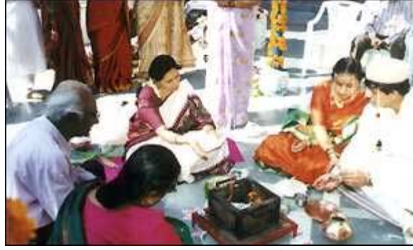
The lady priest guides the couple in their wedding ceremony