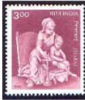
Jijabai, the mother of Shivaji

late 17 th century. Today, she is revered as an inspirational figure in large parts of India along with her illustrious son.